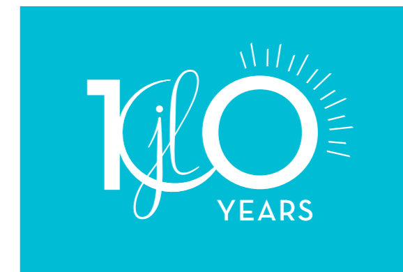
Reverse Knock Out